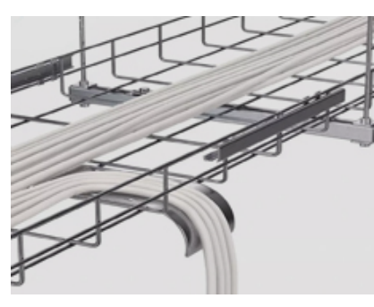
Grid Bridge / Metal Mesh Cable Bridge